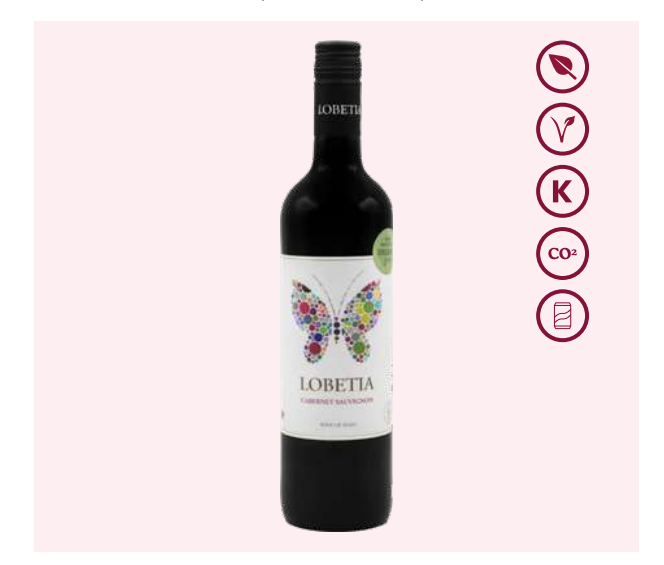
PUNCTUM / ALC 13.5% BY VOL / 750 ML / VT CASTILLA (SPAIN)

Light yellow with green notes. Exotic fruits like pineapple on the nose. Full flavored, fresh, with good acidity on the mouth, it recalls a tropical fruit bouquet.