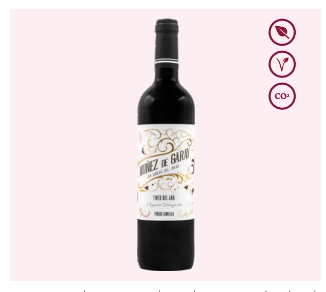
BODEGAS ALBERO / ALC 13.5% BY VOL / 750 ML / D.O. RIBERA DEL JÚCAR (SPAIN)

Soft and inviting on the palate, with flavors of cherry, mulberry, anise and dark berry fruits. It has a lingering finish with a savory complexity and robust tannins.