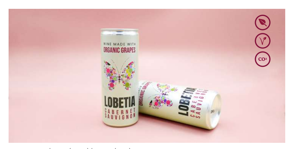
ALC 13.5% BY VOL / 250 ML (8.45 oz) / CUENCA (SPAIN)

Made from our secret family recipe. The botanicals macerate for nine months before bottling. This equisite vermouth is perfect for a number of cocktails.