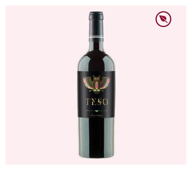
TERRA FIRMA WINERY / ALC 14.1% BY VOL / 750 ML / D.O. YECLA (SPAIN)