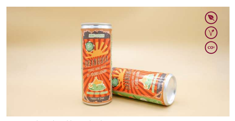
ALC 7.1% BY VOL / 250 ML (8.45 oz) / CUENCA (SPAIN)