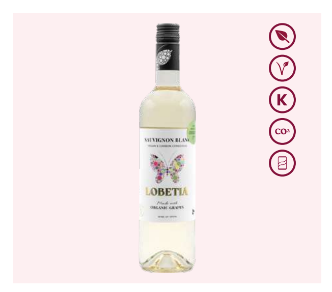
PUNCTUM / ALC 13% BY VOL / 750 ML / VT CASTILLA (SPAIN)