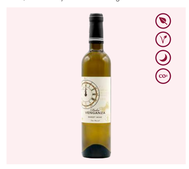
PUNCTUM / ALC 9% BY VOL / 500 ML / VT CASTILLA (SPAIN)

Red berries and cherry bouquet, combines with sweet spices, vanilla and coffee aromas. Complex and harmonious, with velvety tannins and long finish.