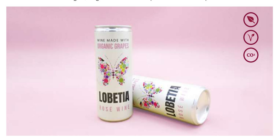
ALC 13% BY VOL / 250 ML (8.45 oz) / CUENCA (SPAIN)

Following the success of our amber wine, this brand new drink is coming to reinvent the concept of white sangria by mixing the best of both worlds. Orangria is a skin contact white wine based sangria, vegan certified and perfect to take anywhere.