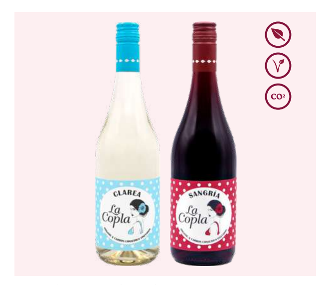
PUNCTUM / ALC 8% BY VOL / 750 ML / CUENCA (SPAIN)