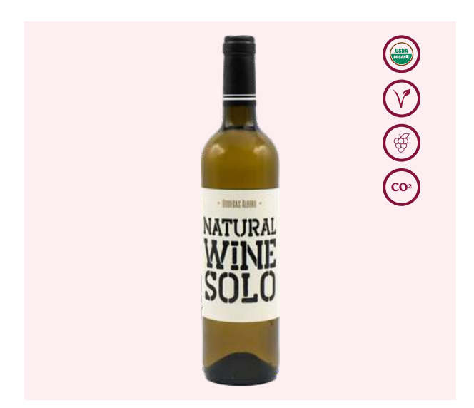
BODEGAS ALBERO / ALC 13% BY VOL / 750 ML / VT CASTILLA (SPAIN)

Natural wine. Bobal & Tempranillo blend. Aromas of ripe red fruit. Clean and persistent aftertaste. Well structured wine, fills the mouth with a polished tannin.