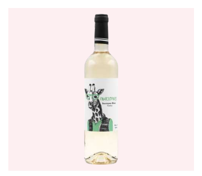
BODEGAS ALBERO / ALC 13% BY VOL / 750 ML / CUENCA (SPAIN)

From the relatively unknown region of Ribera del Júcar, hundreds of years of family tradition bring you the style of rich concentrated reds. Bobal is the indigenous grape.