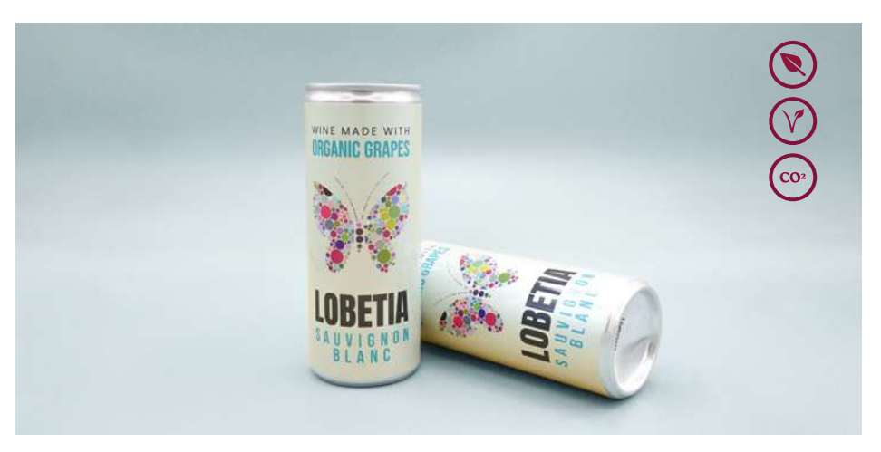
ALC 13% BY VOL / 250 ML (8.45 oz) / CUENCA (SPAIN)

On the nose it has red berries and floral aromas. It offers fresh raspberry and cherry compote flavors on the palate, with a long finish.