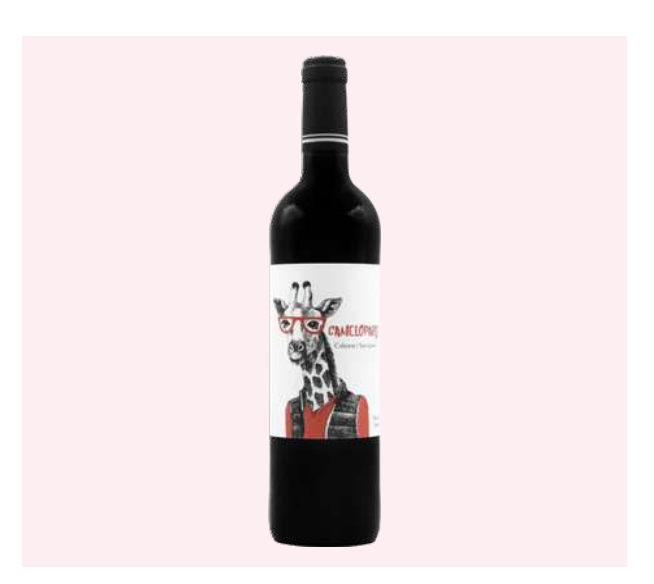
BODEGAS ALBERO / ALC 13.5% BY VOL / 750 ML / CUENCA (SPAIN)

100% Verdejo. Very delicate, pleasant, harmonious and fresh in the mouth, with a good acidity and a long aftertaste.