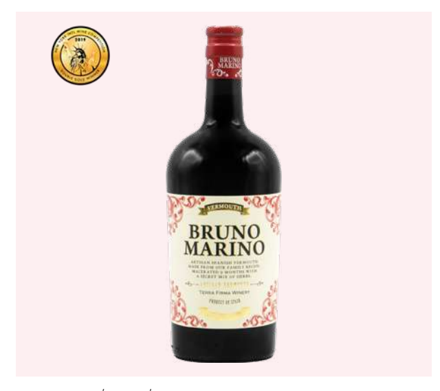
ALC 16% BY VOL / 750 ML / SPAIN

100% Garnacha. An intense cherry red color and a violet shaded rim at first sight. The bouquet has notes of red berries. Sweet tannins and long finish.