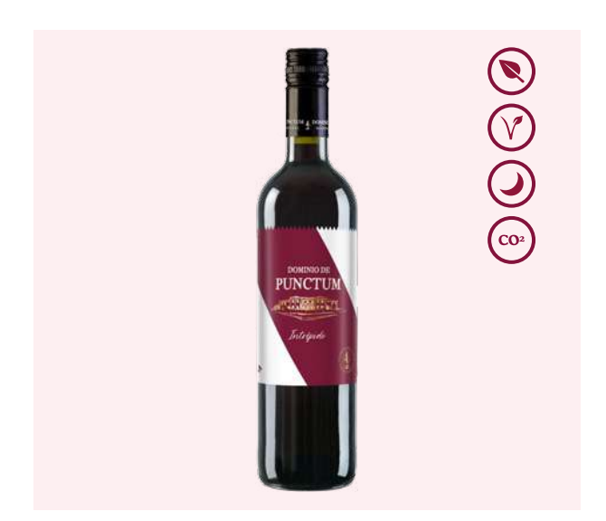
PUNCTUM / ALC 13.5% BY VOL / 750 ML / VT CASTILLA (SPAIN)

Medium bodied with crispy acidity that leads into elegant minerality that lasts on the palate. Biodynamically farmed and estate grown.