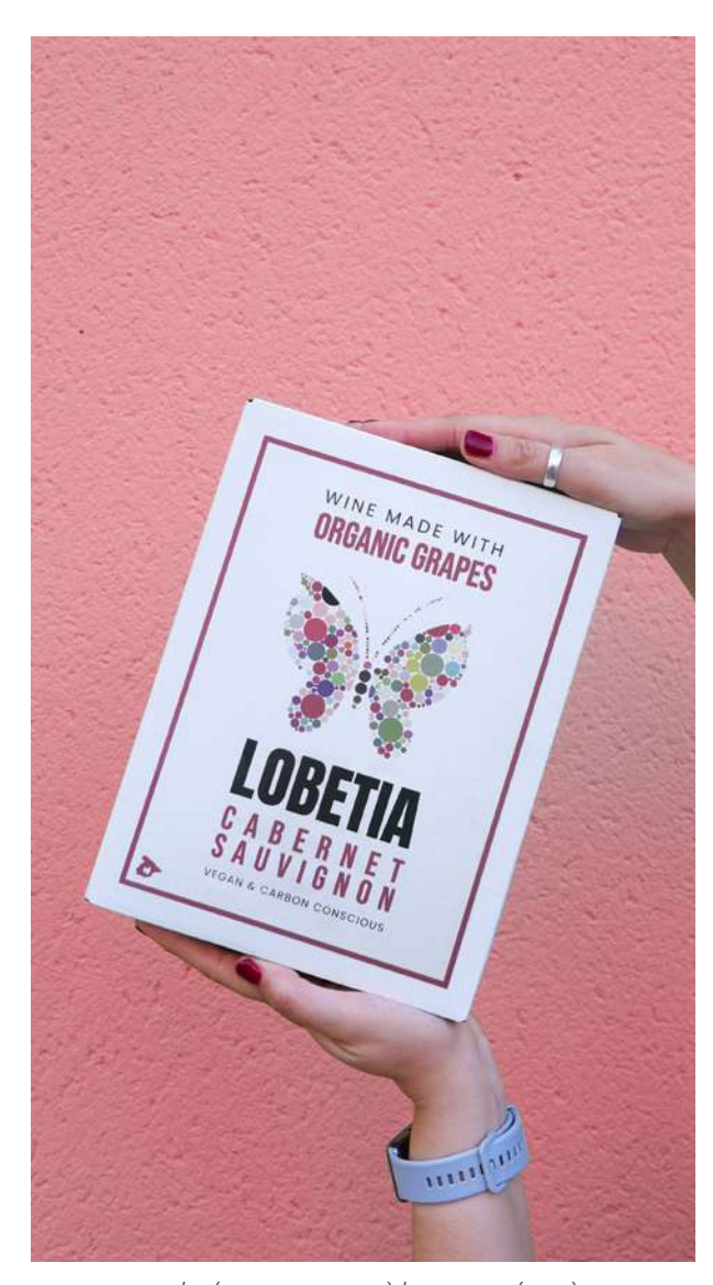
ALC 13.5% BY VOL / 3L (101.44 oz = 4 bottles) / VT CASTILLA (SPAIN)

Made from a Garnacha & Bobal blend. Pale rosé color with passion fruit & strawberry notes.