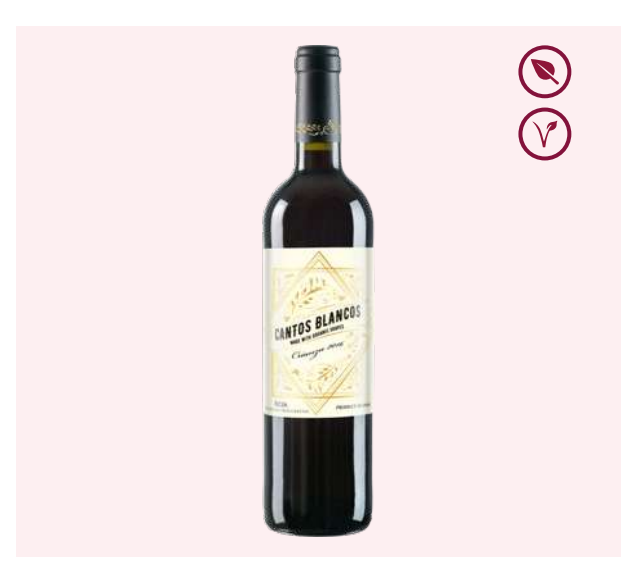
ARRIEZU VINEYARDS / ALC 13.5% BY VOL / 750 ML / D.O.C. RIOJA (SPAIN)

On the nose it has red berries and floral aromas. It offers fresh raspberry and cherry compote flavors on the palate, with a long finish.