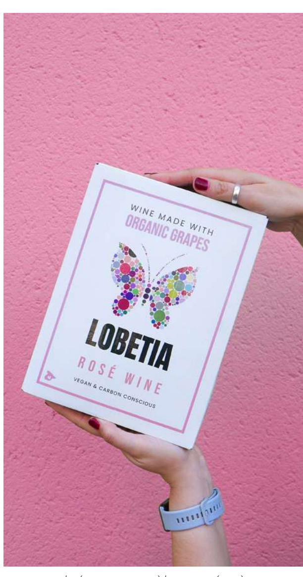
ALC 13% BY VOL / 3L (101.44 oz = 4 bottles) / VT CASTILLA (SPAIN)

100% Sauvignon Blanc. Herbaceous notes on the nose. Light bodied & crispy acidity.