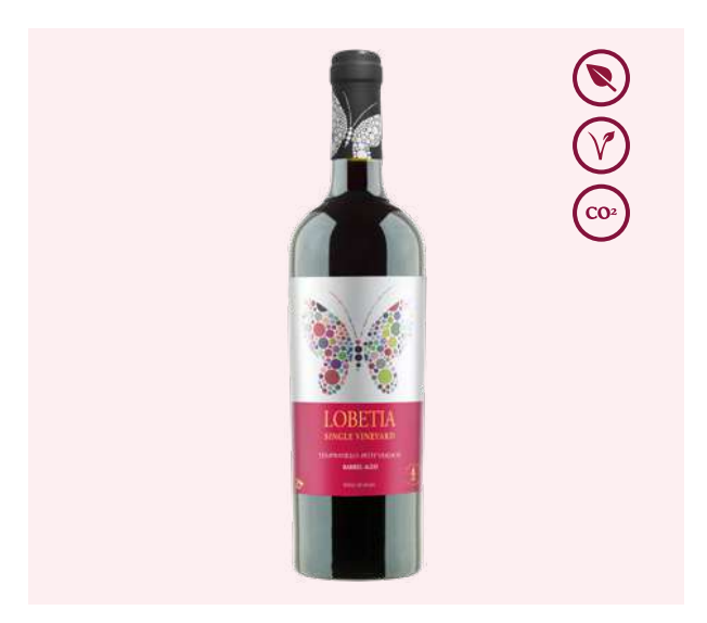
PUNCTUM / ALC 13.5% BY VOL / 750 ML / VT CASTILLA (SPAIN)