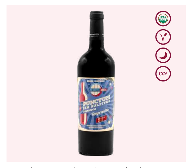
PUNCTUM / ALC 13.5% BY VOL / 750 ML / VT CASTILLA (SPAIN)

100% Verdejo. It shows a bright golden color with lime reflections. Pear aromas and light tropical notes. Mouth watering and well structured acidity.