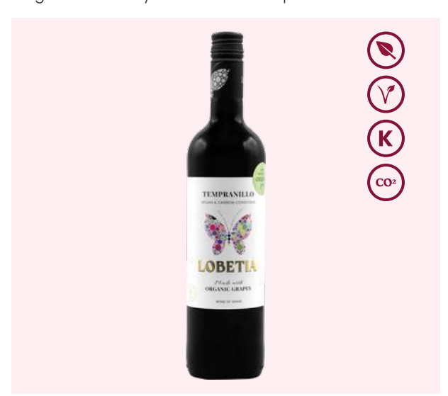
PUNCTUM / ALC 13.5% BY VOL / 750 ML / VT CASTILLA (SPAIN)

100% Sauvignon Blanc. A golden hue and aromas of citrus. Medium bodied with crispy acidity that leads into elegant minerality that lasts on the palate.