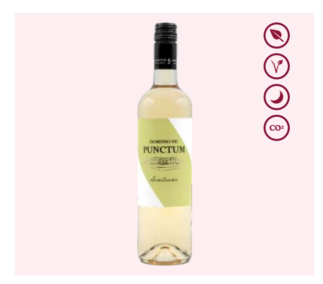
PUNCTUM / ALC 13% BY VOL / 750 ML / VT CASTILLA (SPAIN)