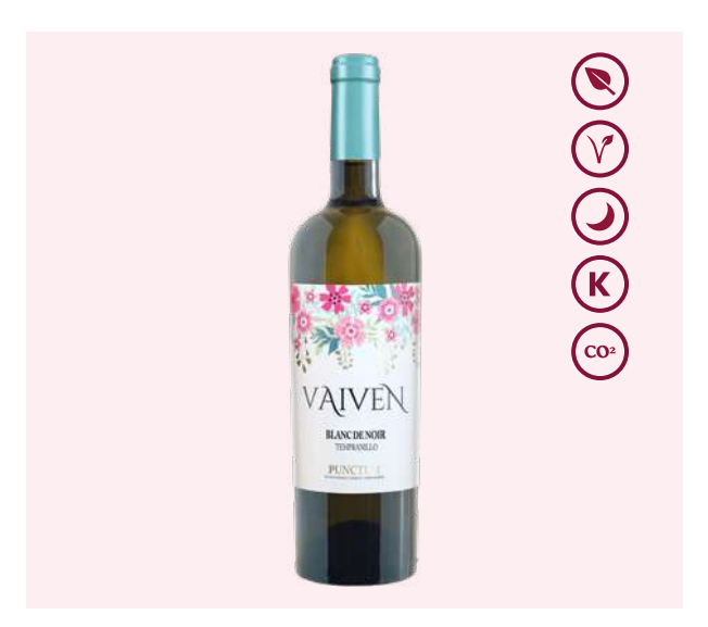
PUNCTUM / ALC 13.5% BY VOL / 750 ML / VT CASTILLA (SPAIN)

Sulfite free pétillant naturel. Delightful citrus aromas on the nose as well as floral notes. Flavors of green apple, lemon and elderflower, along with mineral notes.