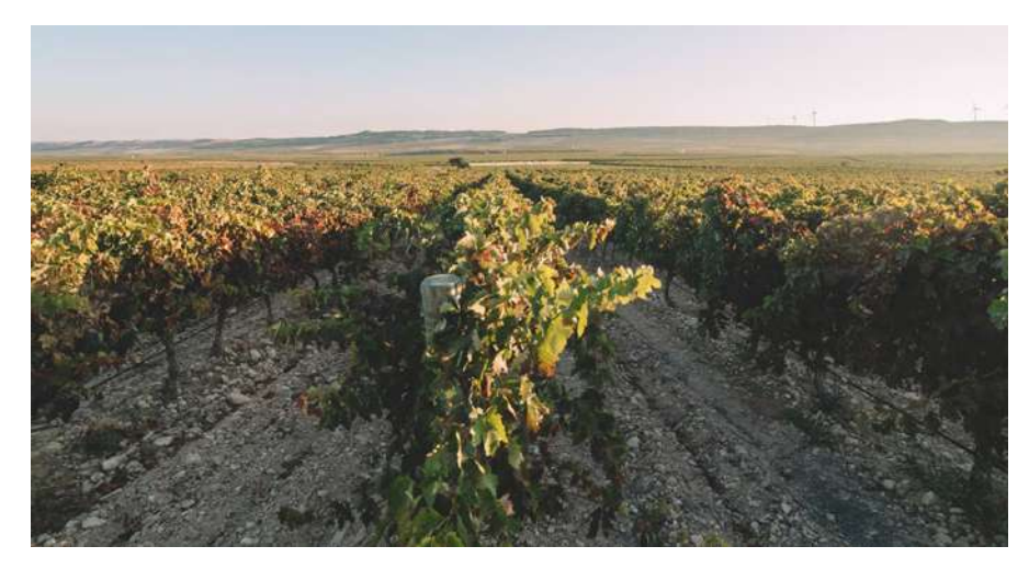
VALLADOLID & NAVARRA (SPAIN)

Family-owned winery, focused on indigenous grapes from their undiscovered region. As one of the very few wineries located in the Ribera del Júcar D.O., they have made it their mission to bring the unique wines from this region to the international spotlight.