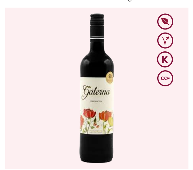
PUNCTUM / ALC 13.5% BY VOL / 750 ML / VT CASTILLA (SPAIN)

Tempranillo & Petit Verdot. Intense cherry red colour and a violet shaded rim. The bouquet has notes of red berries and cherries. Sweet tannins and a long finish.