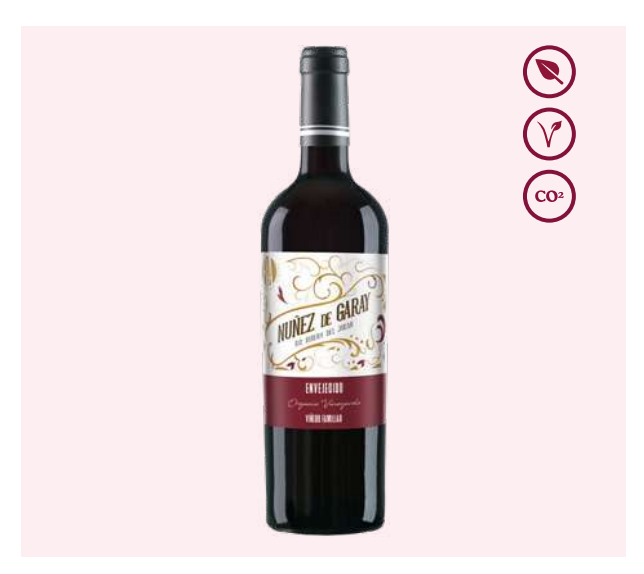
BODEGAS ALBERO / ALC 13.5% BY VOL / 750 ML / D.O. RIBERA DEL JÚCAR (SPAIN)