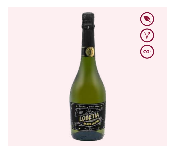
PUNCTUM / ALC 12% BY VOL / 750 ML / CUENCA (SPAIN)

At first sight there is an intense cherry red color and a violet shaded rim. The bouquet has notes of red berries. On the mouth there are sweet tannins and a long finish.