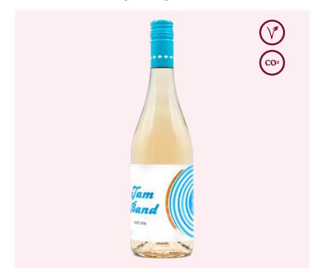
BODEGAS ALBERO / ALC 14.1% BY VOL / 750 ML / VT CASTILLA (SPAIN)

100% Verdejo. Natural wine. Aromas of ripe fruit, citrus notes and hints of herbal notes. Exotic and opulent mouthfeel with a long-lasting finish.