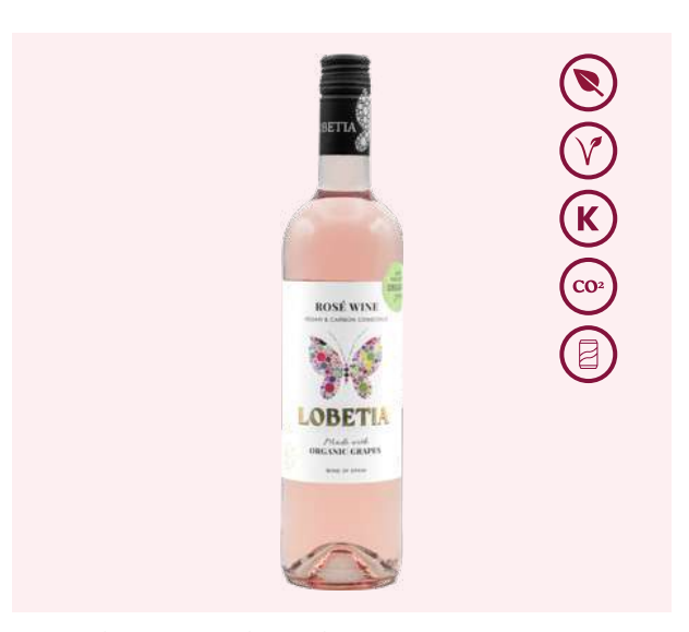
PUNCTUM / ALC 13% BY VOL / 750 ML / VT CASTILLA (SPAIN)

Aromas of violet, blackcurrant and dark plum, overlaying a chocolaty mocha nuance. Flavors of mulberry, anise and dark berry fruits with a hint of nutmeg spice.