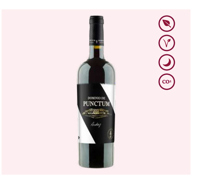
PUNCTUM / ALC 13.5% BY VOL / 750 ML / VT CASTILLA (SPAIN)

Graciano & Cabernet Sauvignon blend. Biodynamically grown. Aromas of spice, vanilla and ripe fruits on the nose. Full body, harmonious and long finish.