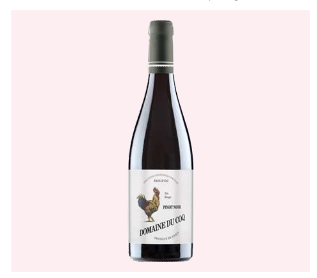
ALC 13.5% BY VOL / 750 ML / PAYS D'OC I.G.P. (FRANCE)

100% Mencía. Dark berries and mature plum bouquet combined with toffee and chocolate notes. Intense yet balanced with firm tannins and a very long finish.