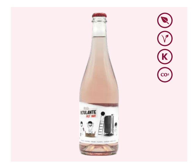
PUNCTUM / ALC 13% BY VOL / 750 ML / VT CASTILLA (SPAIN)

A unique, still wine made from 100% tempranillo. The skins are removed immediately after pressing and the juice is fermented like a white wine.