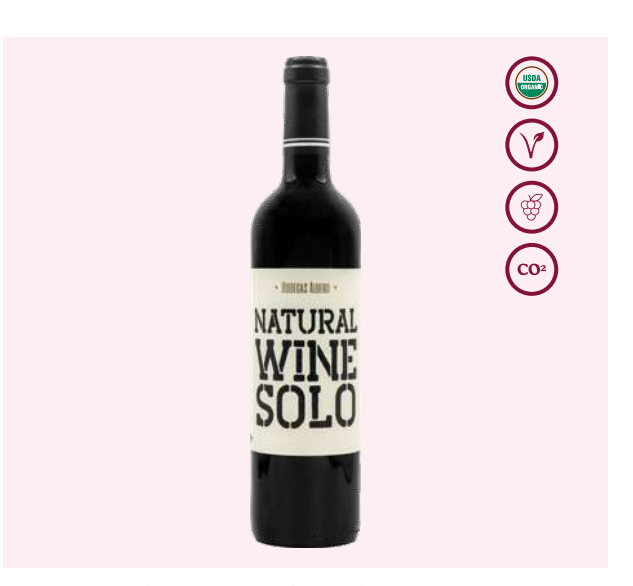
BODEGAS ALBERO / ALC 13.5% BY VOL / 750 ML / VT CASTILLA (SPAIN)

Juicy on the palate with aromas of citrus, lychee and apricot. Bright acidity with a lingering sweetness on the finish. A fun wine to drink, perfect for your next party!