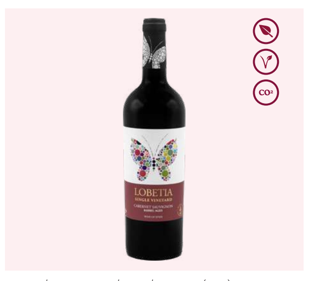
PUNCTUM / ALC 13.5% BY VOL / 750 ML / VT CASTILLA (SPAIN)

Garnacha & Bobal. Shiny raspberry pink color. Red cherry bouquet on the nose. Rich with light citrus flavors on the palate. Fresh and modern profile.