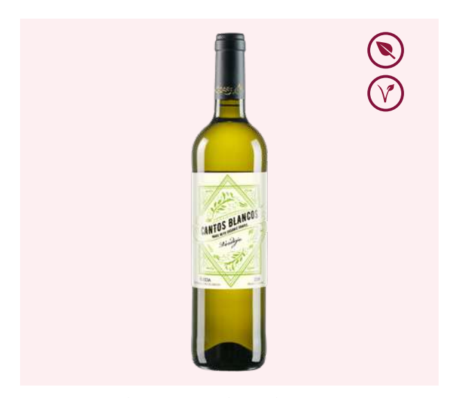
ARRIEZU VINEYARDS / ALC 13.5% BY VOL / 750 ML / D.O. RUEDA (SPAIN)