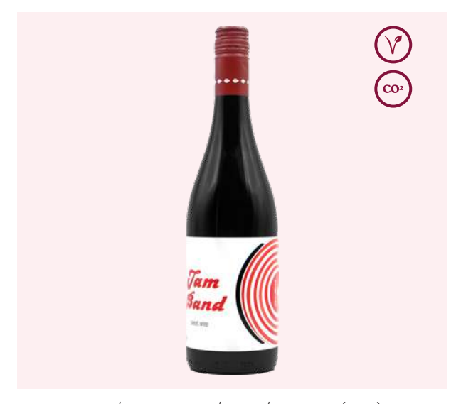
BODEGAS ALBERO / ALC 14.1% BY VOL / 750 ML / VT CASTILLA (SPAIN)

100% Tempranillo. Natural wine. Contrasting flavors of intense red fruits as cherries and plums with some leather hints. Balanced, round tannins and a long, lasting finish.