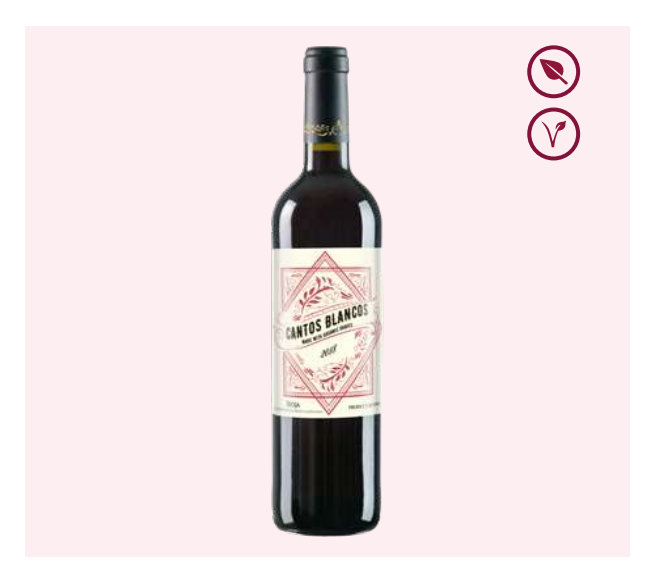
ARRIEZU VINEYARDS / ALC 13.5% BY VOL / 750 ML / D.O.C. RIOJA (SPAIN)

100% Verdejo. A golden hue with green notes. Fruity citrus and pear aromas with light tropical notes on the nose. Good acidity and long finish.