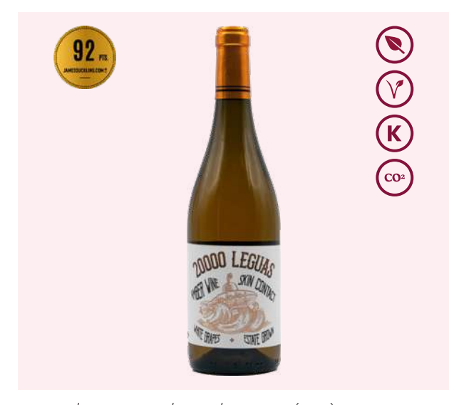
PUNCTUM / ALC 13% BY VOL / 750 ML / VT CASTILLA (SPAIN)

Barrel aged. Brilliant ruby red color with a violet shade. A robust and powerful wine, with dark fruit aromas and hints of vanilla and spice.