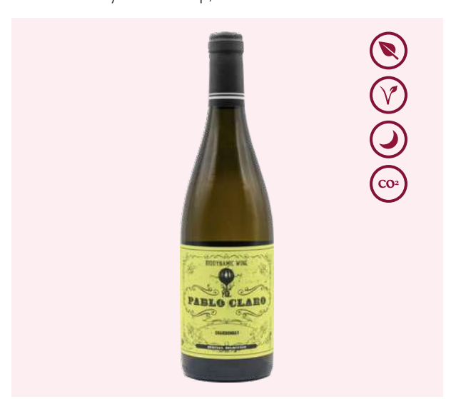
PUNCTUM / ALC 13% BY VOL / 750 ML / VT CASTILLA (SPAIN)

Light straw color with green reflections. A bright wine with passion fruit and herbaceous notes on the nose. Balanced acidity with a crisp, fresh finish.