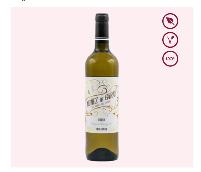
BODEGAS ALBERO / ALC 13% BY VOL / 750 ML / D.O. RIBERA DEL JÚCAR (SPAIN)

Sauvignon Blanc & Verdejo blend. Citrus, wet grass and green apple aromas. Clean, fresh acidity with lingering tangerine notes.