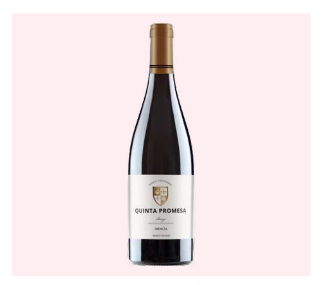
TERRA FIRMA WINERY / ALC 14.5% BY VOL / 750 ML / D.O. BIERZO (SPAIN)

Made mostly of Marselan. Elegant and fresh on the palate. The fruits and spices give this wine a nice balance and harmony.