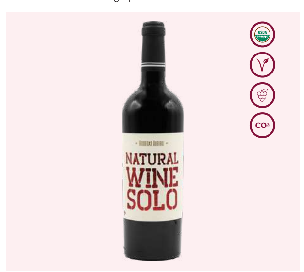
BODEGAS ALBERO / ALC 13.5% BY VOL / 750 ML / VT CASTILLA (SPAIN)

Bobal & Tempranillo blend. Rounded tannins and delightful acidity on the palate. The barrel adds warming notes of sweet baking spice to the wine.