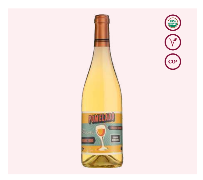
PUNCTUM / ALC 13% BY VOL / 750 ML / VT CASTILLA (SPAIN)