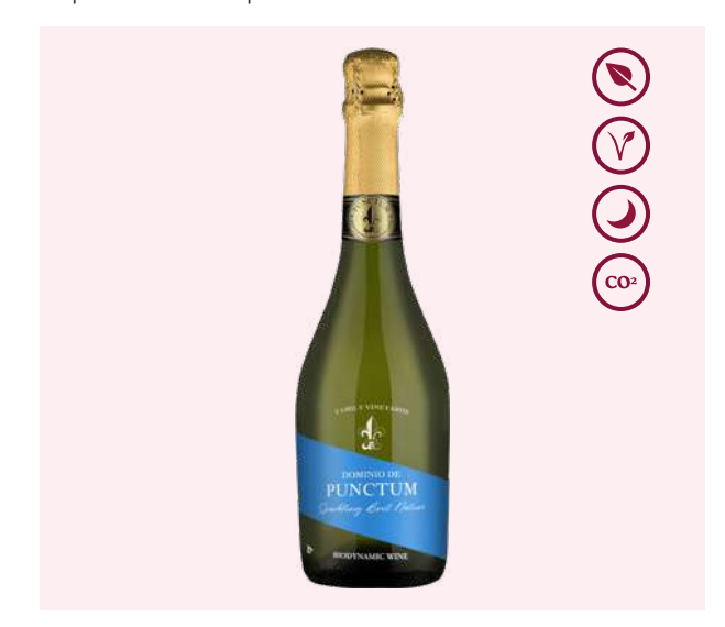
PUNCTUM / ALC 12% BY VOL / 750 ML / VT CASTILLA (SPAIN)

On the nose it has exotic fruits like pineapple. Creamy bubbles full flavored, fresh, with good acidity, it recalls a tropical fruit bouquet.