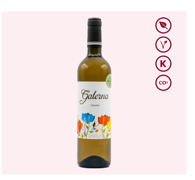
PUNCTUM / ALC 12.5% BY VOL / 750 ML / VT CASTILLA (SPAIN)

Scents of peaches, lychees, and white flowers. It has a rich flavor, it's refreshing and has good acidity. It recalls a tropical fruit bouquet.