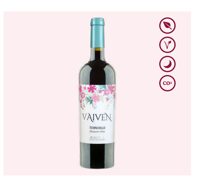
PUNCTUM / ALC 13.5% BY VOL / 750 ML / D.O. LA MANCHA (SPAIN)

Sulfite free pétillant naturel. Bright and crisp with aromas of berries and watermelon. Delicate palate with red summer fruit notes. Medium body, well structured acidity.