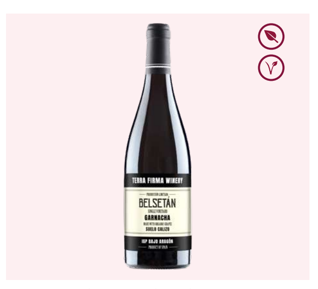
TERRA FIRMA WINERY / ALC 14% BY VOL / 750 ML / BAJO ARAGÓN I.G.P. (SPAIN)

100% Pinot Noir. Red fruits like raspberry and strawberry with notes of spices and peppermint. Well structured, this wine is balance and harmony.