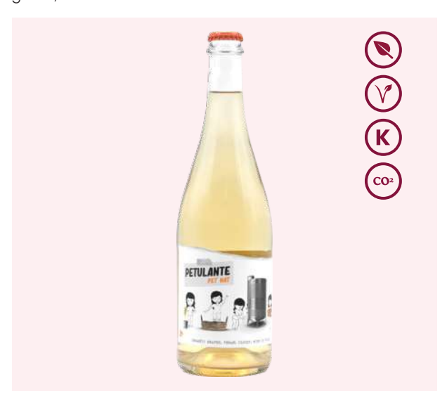
PUNCTUM / ALC 13% BY VOL / 750 ML / VT CASTILLA (SPAIN)

Low intervention Natural amber wine. Made from a blend of white grapes and fermented with their skins. USDA Organic, no sulfites added.