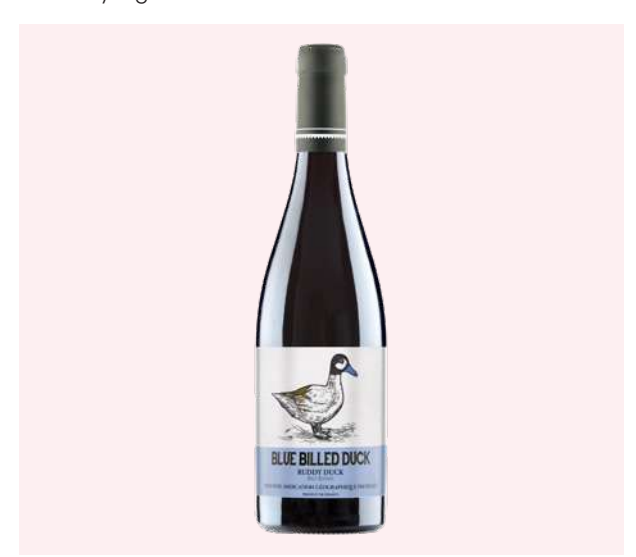
TERRA FIRMA WINERY / ALC 14% BY VOL / 750 ML / CÔTES DE GASCOGNE (FRANCE)

Wine made from organically grown grapes. Deep red color. Ripe fruit combined with spices. Velvet tannins and full body. Aged in oak.