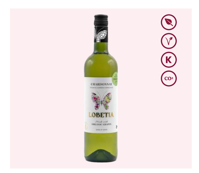
PUNCTUM / ALC 13% BY VOL / 750 ML / VT CASTILLA (SPAIN)

Deep cherry color with a violet shade. Red berries and cherries on the bouquet. Fresh and harmonious with long finish. Consistent Best Buy in all trade magazines.