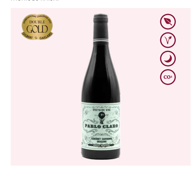
PUNCTUM / ALC 13.5% BY VOL / 750 ML / VT CASTILLA (SPAIN)

Beautiful cherry red color with a purple undertone. The nose shows off bright red berry notes. Smooth and harmonious finish.