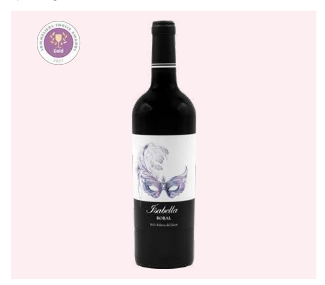
BODEGAS ALBERO / ALC 14.5% BY VOL / 750 ML / D.O. RIBERA DEL JÚCAR (SPAIN)

Clarea: Viura, lemon and grape juice with a sparkling touch. Sangria: Tempranillo, lemon, orange and grape juice with a sparkling touch.